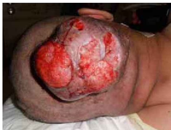
Fig. 1 Photograph shows a large exophytic scalp tumour mass.

Proliferating tricholemmal tumour (PTT) is a rare tumour of the skin, which is more common in adults and the elderly. The tumour has a female preponderance and is mostly seen in the scalp region (90%), with occurrences on the face, trunk, back and forehead in decreasing order of frequency. (1) PTT typically presents as a solitary large exophytic mass featuring a solid-cystic multi-lobulated morphology. The tumour is derived from the outer sheath of the hair follicle. Benign mimics of the tumour include epidermal or tricholemmal cyst, while malignant mimics mainly comprise squamous cell carcinoma (SCC) and tricholemmal carcinoma. While most of these tumours