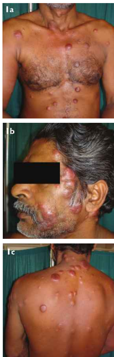
Fig. 1 Photographs show (a) nodules with central necrosis on the anterior trunk and (b) face; and (c) skin-coloured, erythematous nodules on the posterior trunk of the patient.

On physical examination, we found multiple non-tender, indurated, erythematous or hyperpigmented nodules measuring 2–5 cm in diameter present over the trunk,