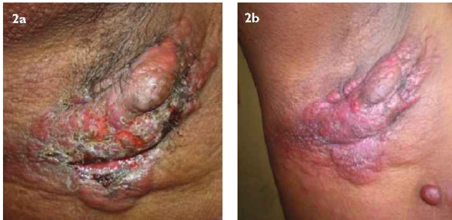
Fig. 2 Photographs show (a) a fungating mass in the right axilla at initial presentation and (b) regression of the axillary lesion after the fifth cycle of chemotherapy.