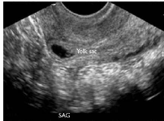
Fig. 4 Repeat transvaginal US image shows interval development of a small yolk sac within the cystic structure.