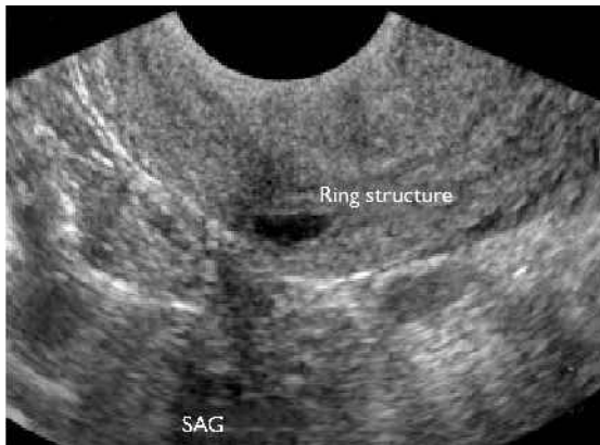
Fig. 3 Transvaginal US image shows a ring structure measuring 1.2 cm × 0.9 cm × 0.7 cm in the lower anterior uterine wall at the region of the previous scar.