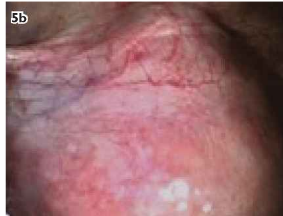
Fig. 5 Laparoscopic images show (a) Caesarean scar pregnancy (arrow) at the lower uterine segment and (b) Caesarean scar pregnancy after intramyometrial vasopressin injection.

transabdominal ultrasonography (US) revealed a viable foetus and placenta praevia major. The patient was resuscitated, and her haemoglobin level dropped from 9.0 g/dL on admission to 5.5 g/dL the following morning. She subsequently underwent exploratory laparotomy.