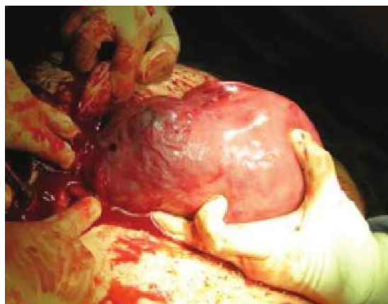
Fig. 1 Photograph shows ruptured Caesarean scar pregnancy during laparotomy.

Implantation of an ectopic pregnancy within a previous Caesarean section (CS) scar is a rare condition. However, its incidence is increasing over the years due to the rise in CS rates worldwide. Caesarean scar pregnancy is potentially life-threatening if not diagnosed and treated early. It may lead to catastrophic complications, such as uncontrolled haemorrhage and uterine rupture as the pregnancy progresses, which may require hysterectomy and result in subsequent loss of fertility. The outcome is dependent on early diagnosis and timely intervention. Hence, it is important that antenatal care providers are aware of this rare form of ectopic pregnancy. We report two cases of Caesarean scar pregnancy that were diagnosed at different periods during gestation,