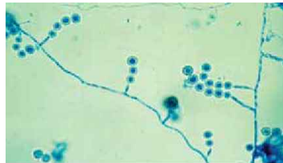
Fig. 2 Photomicrograph of the culture shows chains of thick-walled conidia, characteristic of Scopulariopsis spp. (Lactophenol cotton blue, \times 10 ).

In the present case, we speculated that the tobacco that the immunocompetent patient used to smoke for the past