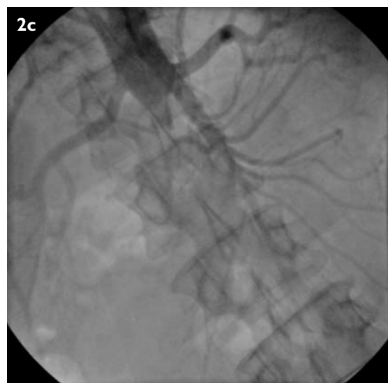
Fig. 2 (a–c) Anteroposterior abdominal aortogram shows the total occlusion of the abdominal aorta below the renal arteries. Three collaterals are arising from the distal part of the aorta, one of which will enter the pelvis to supply the pelvic organs and one each will feed the limb vessels. Both renal arteries are normal.