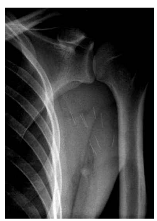
Fig. I Frontal radiograph shows multiple hypodermic needles in the axilla.

Radiography and a nerve conduction study were organised. The radiograph of his left axilla (Fig. 1) showed multiple hypodermic needles. His nerve conduction study was consistent with a nerve injury above the level of the elbow, although the exact location was not determined.