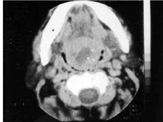
Fig. 1 Axial CT image taken at the level of mandible shows a round hyperdense structure with few calcified specks in it located at the posterior aspect of the tongue.

A 45-year-old woman attended the outpatient department of otolaryngology at our Institute with chief complaints of difficulty in swallowing and change of voice for the last