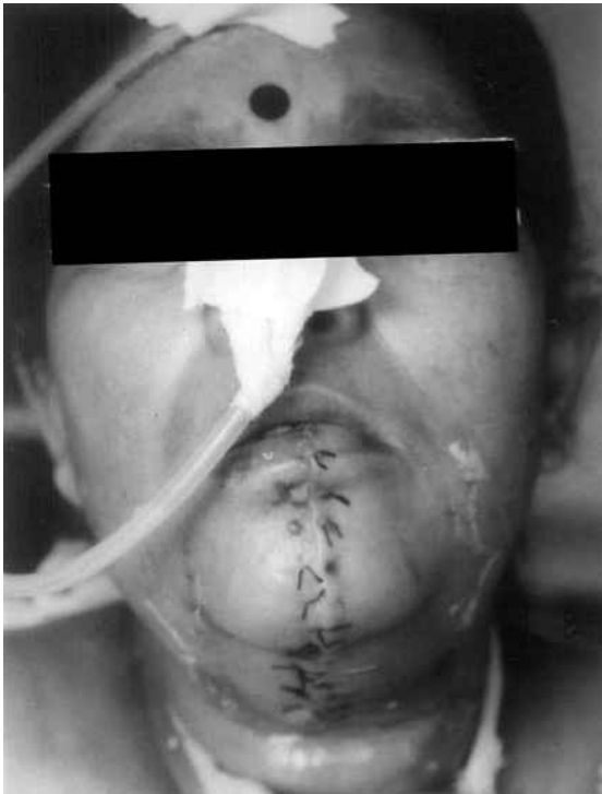
Fig. 3 Postoperative clinical photograph of the patient shows the midline incision used.

round, sessile mass of approximately 4 cm in diameter in the midline, at the base of the tongue. On palpation, the mass was firm and immobile with well-defined margins, smooth surface and overlying normal mucosa. No cervical lymph nodes could be palpated. Routine preoperative investigations, such as complete haemogram and urine examinations, were within normal limits.