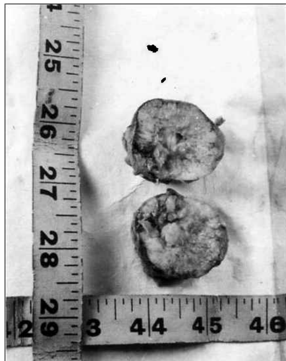
Fig. 2 Specimen photograph shows the excised encapsulated mass.

two years. Initially, the symptoms were very mild, i.e. the patient had a foreign body sensation, or the impression of something stuck in the throat. Subsequently, she developed some difficulty in taking solids accompanied with a marked change in her speech. There was no difficulty in swallowing liquids, but her voice had perceptibly taken on to a plummy character. The patient also started snoring heavily. However, there was no evidence of sleep apnoea. There was also no symptom suggestive of disturbed thyroid status. On clinical examination of her oral cavity, a mass was noted at the base of the tongue during its protrusion. The indirect laryngoscopic examination revealed a