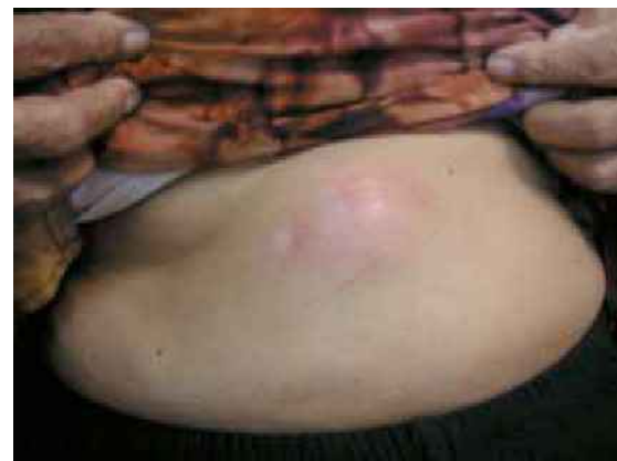
Fig. 1 Clinical photograph shows epigastric swelling with erythematous overlying skin.

Physical examination revealed right subcostal swelling with erythematous overlying skin and mild tenderness (Fig. 1). CT of the abdomen showed tumour seeding along the previous needle biopsy tract, extending from the primary