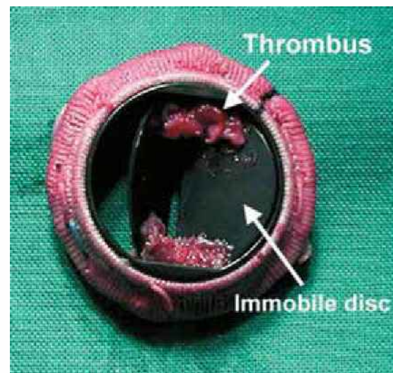
Fig. 2 Photograph shows the excised mitral valve laden with thrombus.

Department of Medicine, Section of Cardiology, Aga Khan University Hospital, PO Box 3500, Stadium Road, Karachi 74800, Pakistan.