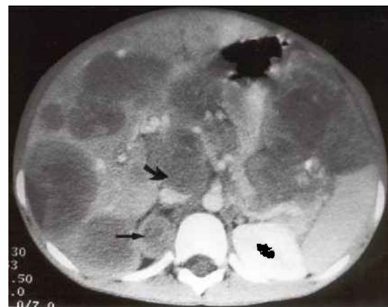
Fig. 1b Contrast-enhanced CT image of the abdomen shows a soft tissue mass lesion in right adrenal gland (arrow), peripancreatic lymphadenopathy (curved arrow) and multiple hypodense lesions in the liver.

In addition, there was a mass lesion in the right adrenal gland and multiple enlarged peripancreatic, coeliac and gastrohepatic lymph nodes (Fig. 1b).