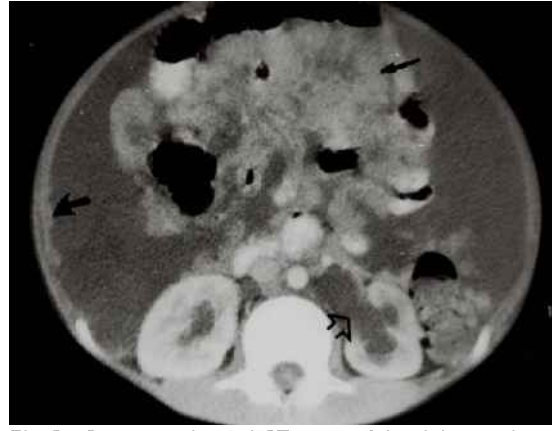
Fig. 3a Contrast-enhanced CT image of the abdomen shows multiple soft tissue mass lesions in the mesentery (arrow), ascites, nodular thickening of parietal peritoneum (curved arrow) and left-sided hydronephrosis (open arrow).

a round cell tumour (Fig. 2). The immunohistochemical studies revealed that the tumour cells were reactive to antibodies against keratin, desmin and positive for synaptophysin, confirming the diagnosis of DRCT. In view of the metastatic disease, chemotherapy was started. However, due to the aggressive nature of the disease, the patient died two months after diagnosis.