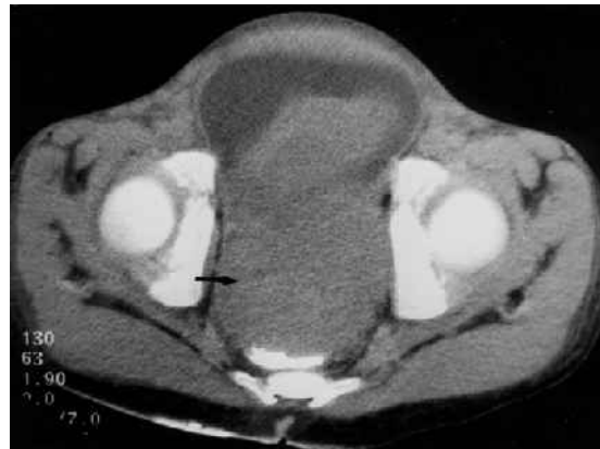
Fig. 3b Contrast-enhanced CT image (with rectal contrast) of the pelvis shows a large soft tissue mass lesion (arrow) with invasion of the anterior rectal wall.

DRCT is an aggressive malignancy found predominantly in adolescents and young adults. The group of round cell tumour includes tumours such as Ewing's sarcoma, neuroblastoma, Wilm's tumour, rhabdomyosarcoma and primitive neuroectodermal tumour (5) . DRCT is a distinct entity with well-recognised histological features, karyotype and immunochemical characteristics (6) . The cell of origin may be from mesothelial, submesothelial or subserosal mesenchyme of the abdominal cavity. At histological analysis, the tumour manifests as islands