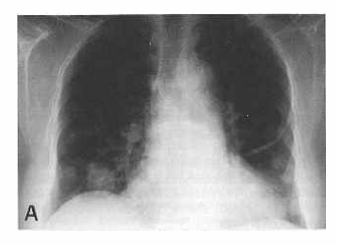
Fig 1 – Good partial response in a patient with pulmonary metastases. (A) Before chemotherapy, (B) after two cycles of combination chemotherapy