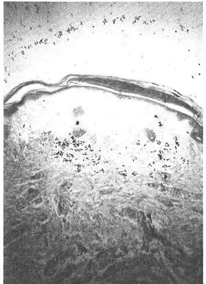
Fig. 5. Histology of the skin (Case 1). Note subepidermal blister with minimal upper dermal infiltrate. There is hyaline cuffing of the upper dermal vessels on Periodic Acid Schiff stains, characteristically seen in porphyria cutanea tarda.