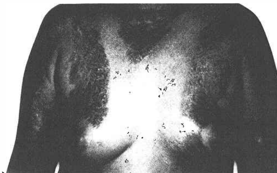
Fig. 3. Case 2. Porphyria cutanea tarda on anterior chest and breast. Note similarity of distribution of plaques to case 1.