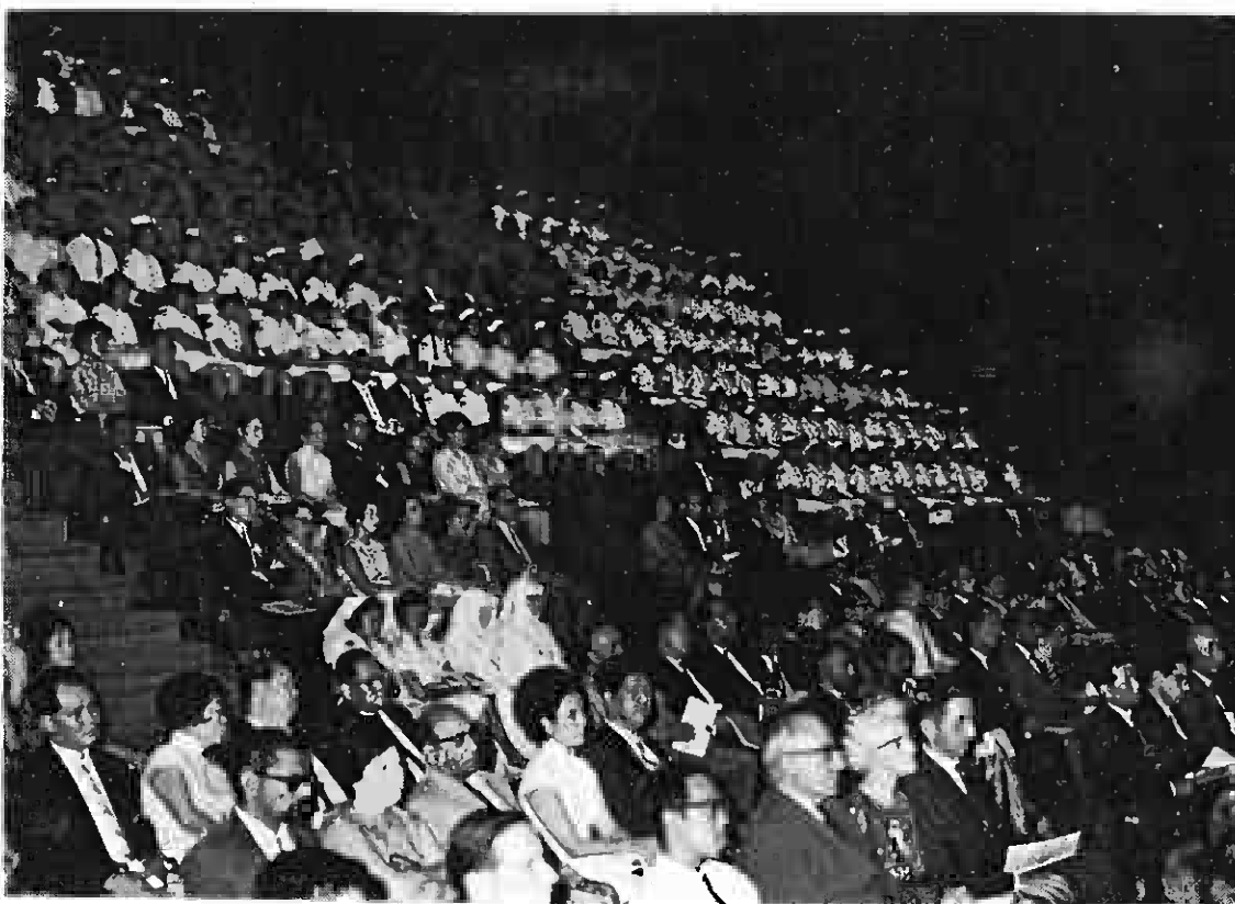
Part of the audience listening attentively to the Minister's opening address.