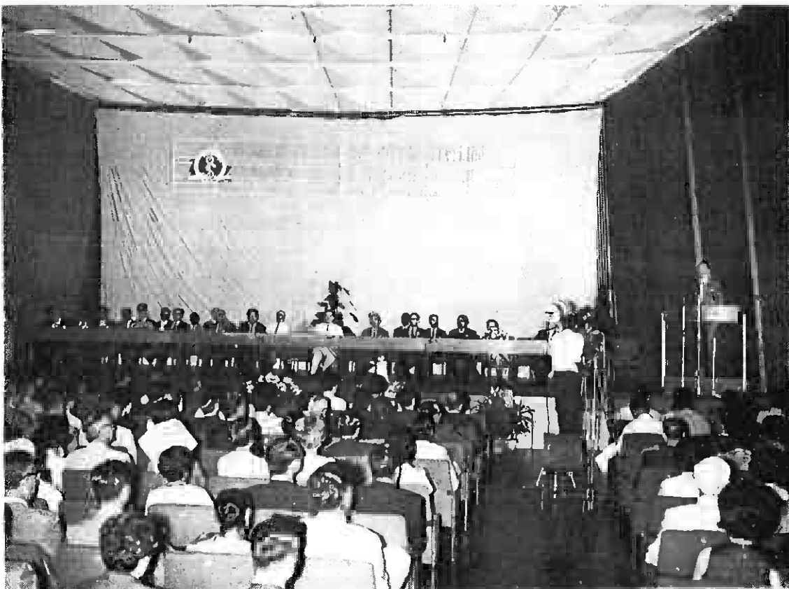
The Minister in his opening address declares the Convention open. On Stage, second row, are some of the foreign delegates.